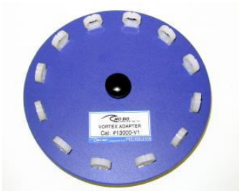
Vortex Adapter 13000-V1 Holds 12 (1.5 - 2.0 ml) Tubes