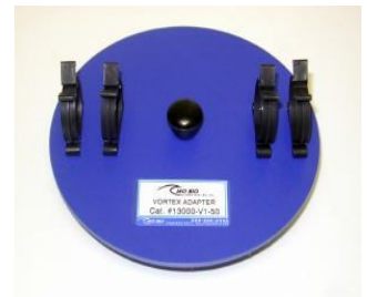
Vortex Adapter 13000-V1-50 Holds 2 (50 ml) Tubes