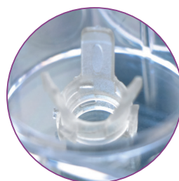
Insert for transport