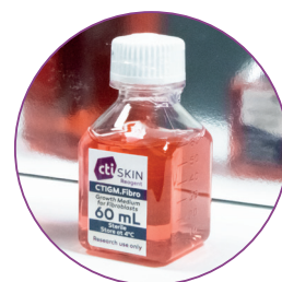
CTISKIN® Reagent in 250-125-60 mL